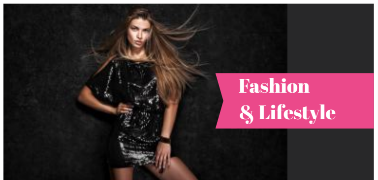
Fashion & Lifestyle